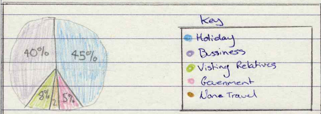
Graph 1. Percentage of Population's travel reasons

Refer to Graph 1. This graph shows the percentage of population travel reasons. As the graph states 45% of travel is for holiday and 40% of travel is for business. This shows people need a place to stay. The economic enterprise studied on a local scale is the ANA Hotel.